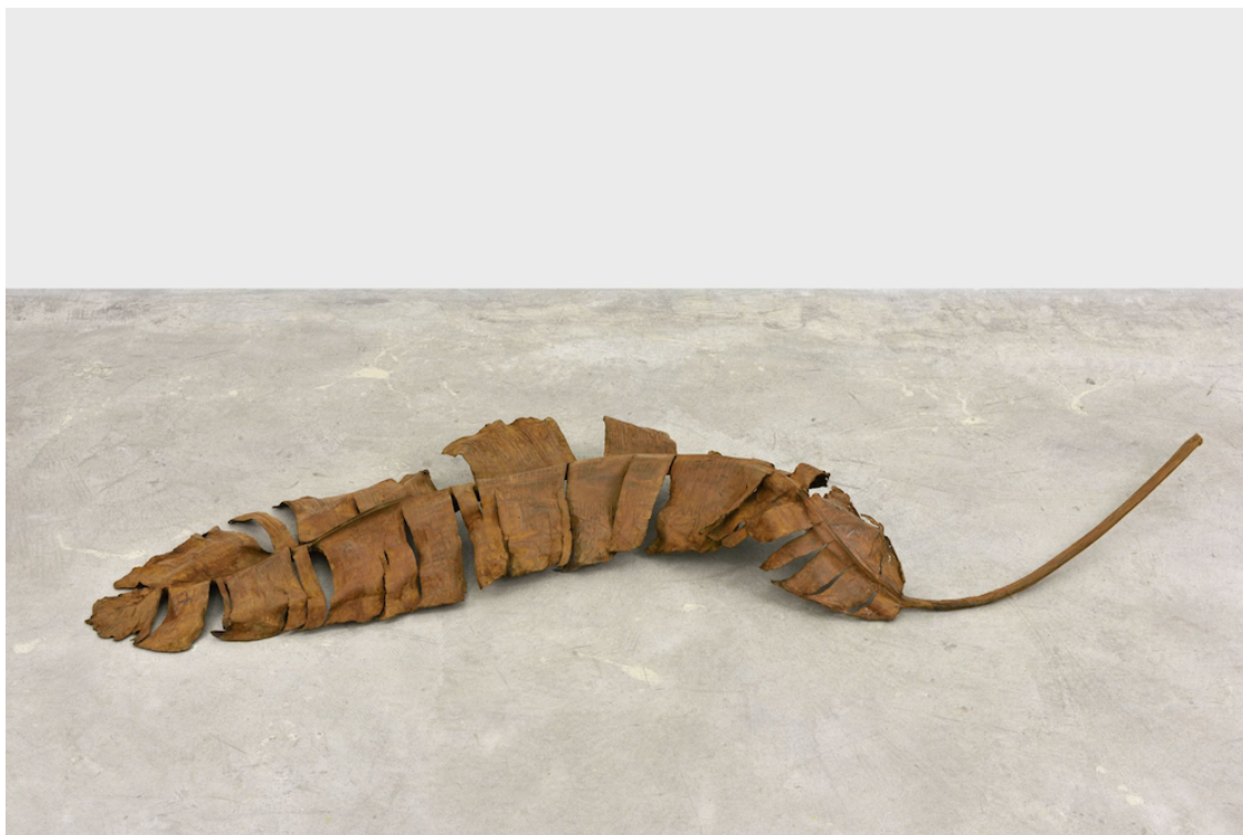
5_Thu Van Tran, Novel Without a Title #5, 2019, Bronze, 202 x 35 x 14 cm Courtesy of the Artists and Almine Rech. Photographer : Rebecca Fanuele