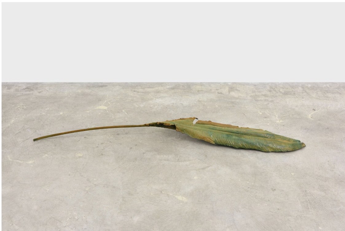
4_Thu Van Tran, Novel Without a Title #2, 2019, Bronze, 167 x 22 x 13 cm