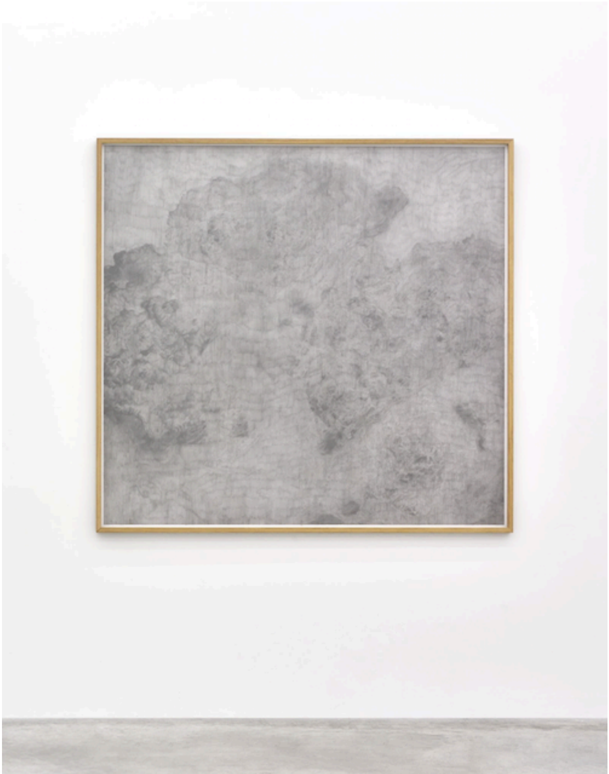
6_Thu Van Tran, Trail Dust, 2015, Graphite on Canson Paper, 152 x 162 x 4 cm